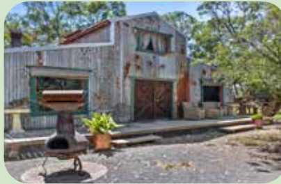
Rusty Springs, Avenel