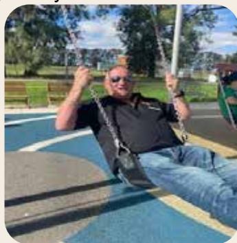
Swinging in Parkes