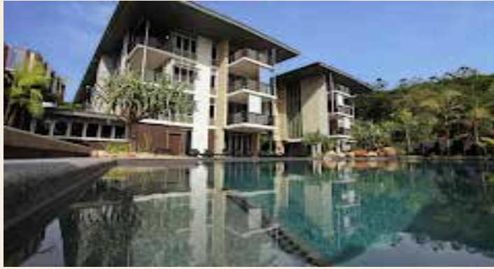
Peppers Resort Noosa - Venue of the 2026 Nationals