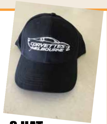
3. HAT $12