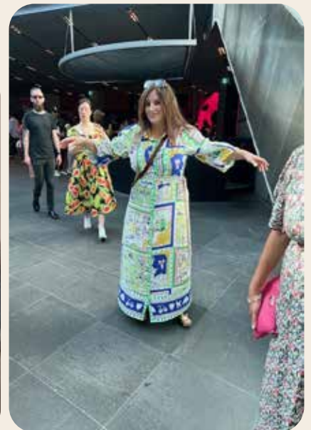
Oh, and by the way, there was plenty of Artwork to be seen also.