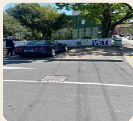
Corvettes have their parking privileges