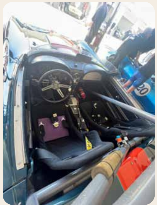
Corvettes at the track and in the pits