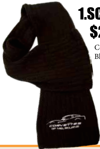
1. SCARF $20