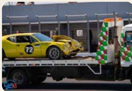
Pantera V Corvette and the wall