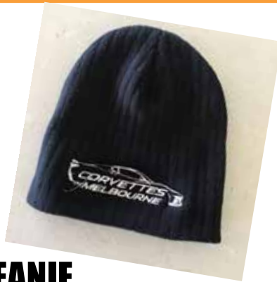
2. BEANIE $12