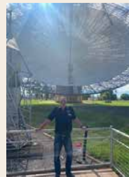
At The Dish, Parkes