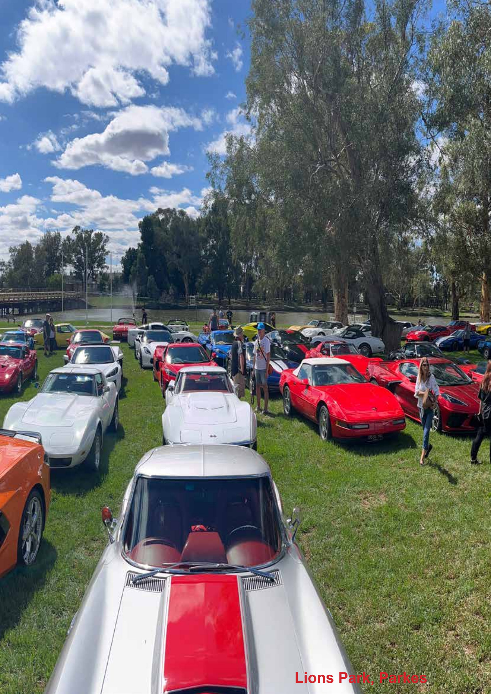
Lions Park, Parkes