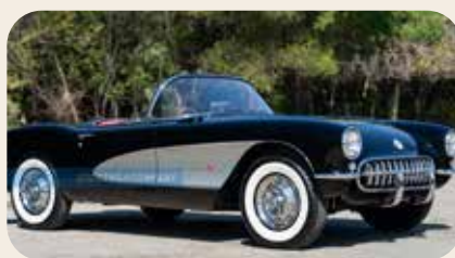
1957 Chevrolet Corvette 283/283 Fuel Injected Roadster - $128,800