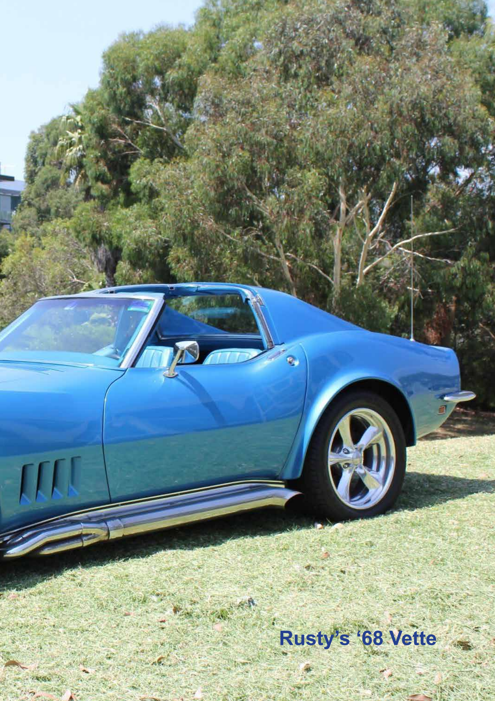
Rusty's '68 Vette