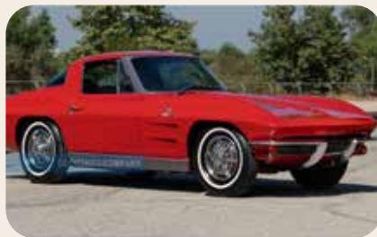
1963 Chevrolet Corvette Z06 Big Tank Split Window Coupe - $313,000