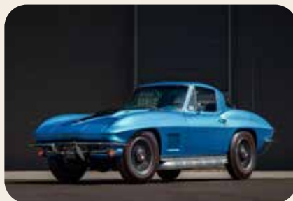
1967 Chevrolet Corvette Coupe $167,200