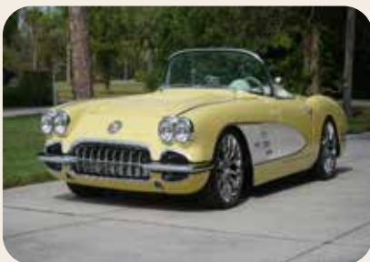
1958 Chevrolet Corvette Convertible $181,500