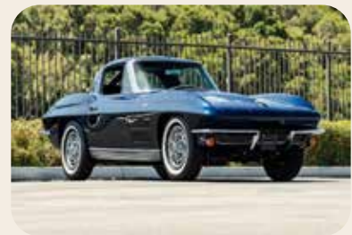
1963 Chevrolet Corvette Split Window - $225,500