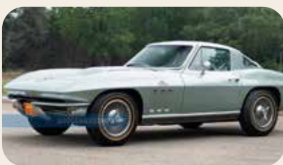
1966 Chevrolet Corvette 427/450 Coupe - $134,400