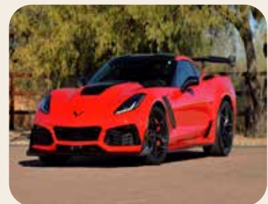
2019 Chevrolet Corvette ZR1 $165,000