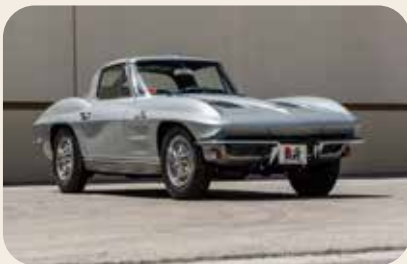
1963 Chevrolet Corvette Z06 Split Window Coupe - $522,500

$2.3 million is a lot of money for a Corvette, but this car is worth every penny.