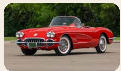
1959 Chevrolet Corvette Convertible - $112,750