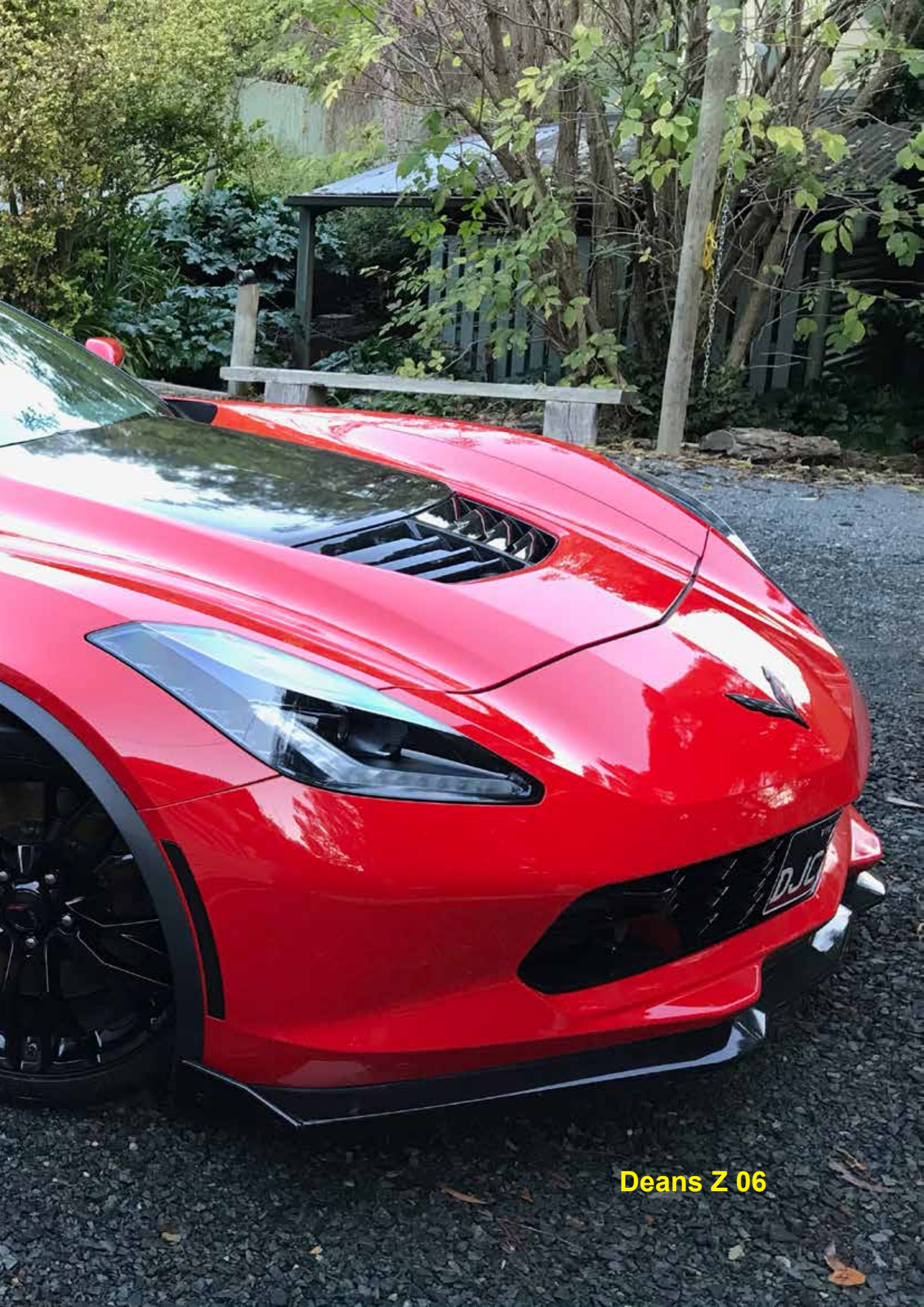
Deans Z 06