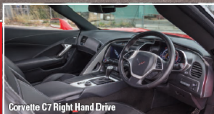
Corvette C7 Right Hand Drive

See our website for all our new Corvette & Camaro images & info