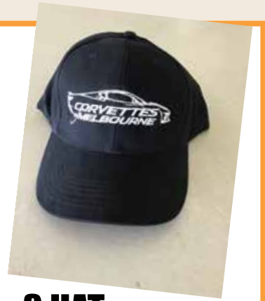
3. HAT $12