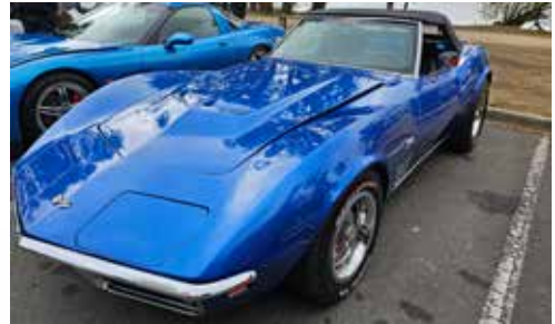
Entrant: Colin Somerton Entry No: 43A