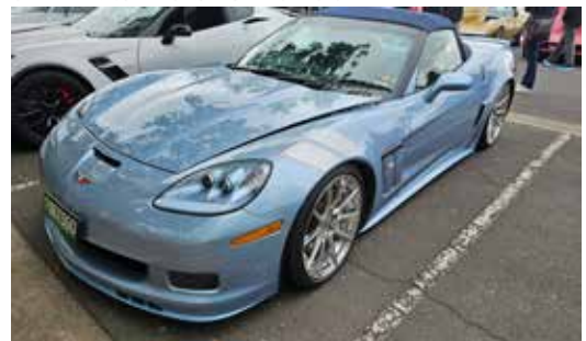
Entrant: Tony Asquith Entry No: 2