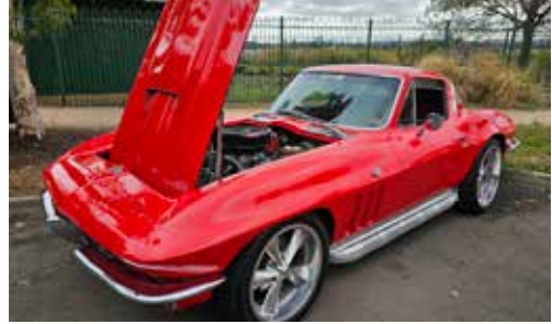
Entrant: Esther Davis Entry No: 137