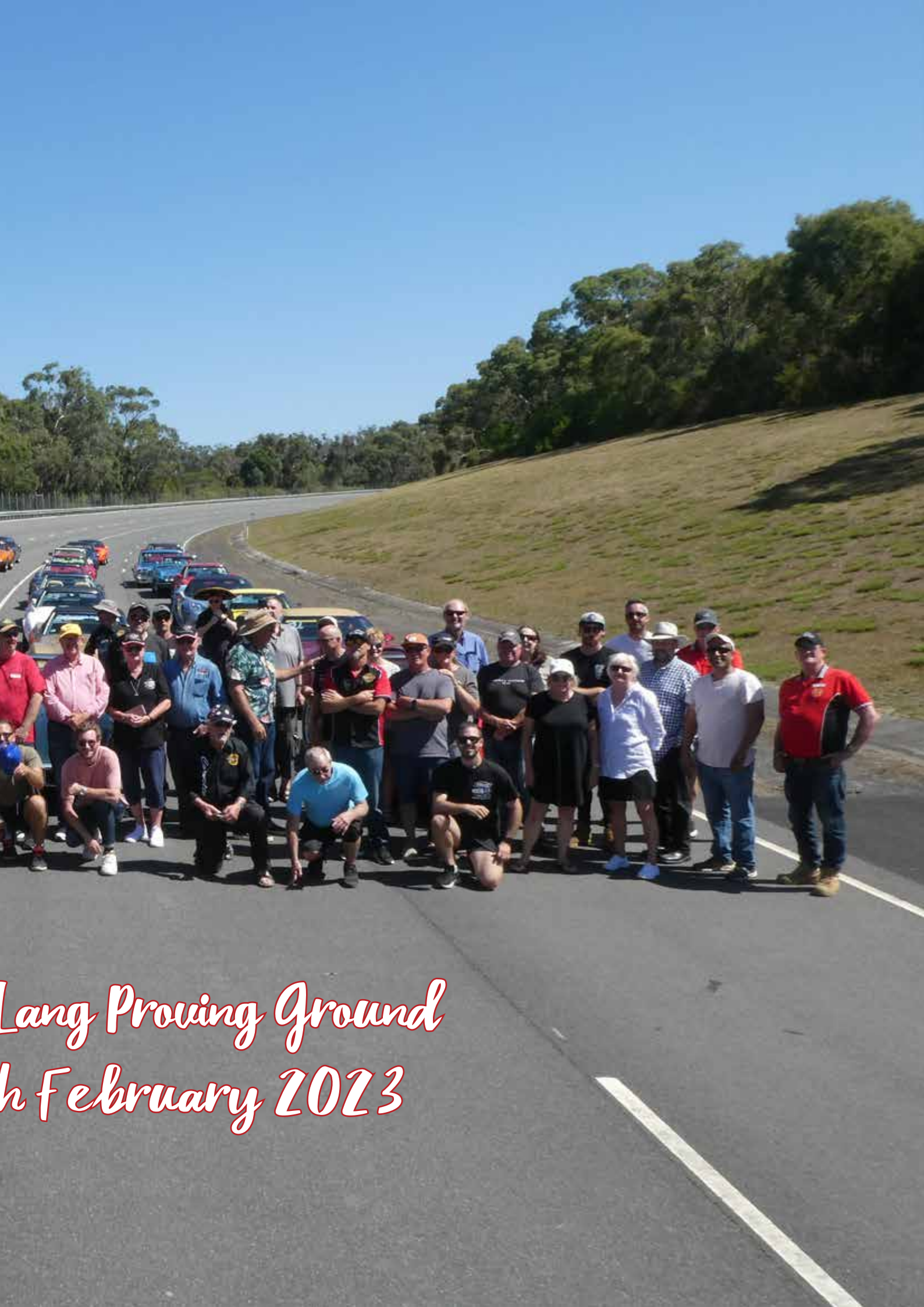
Lang Proving Ground 14 February 2023