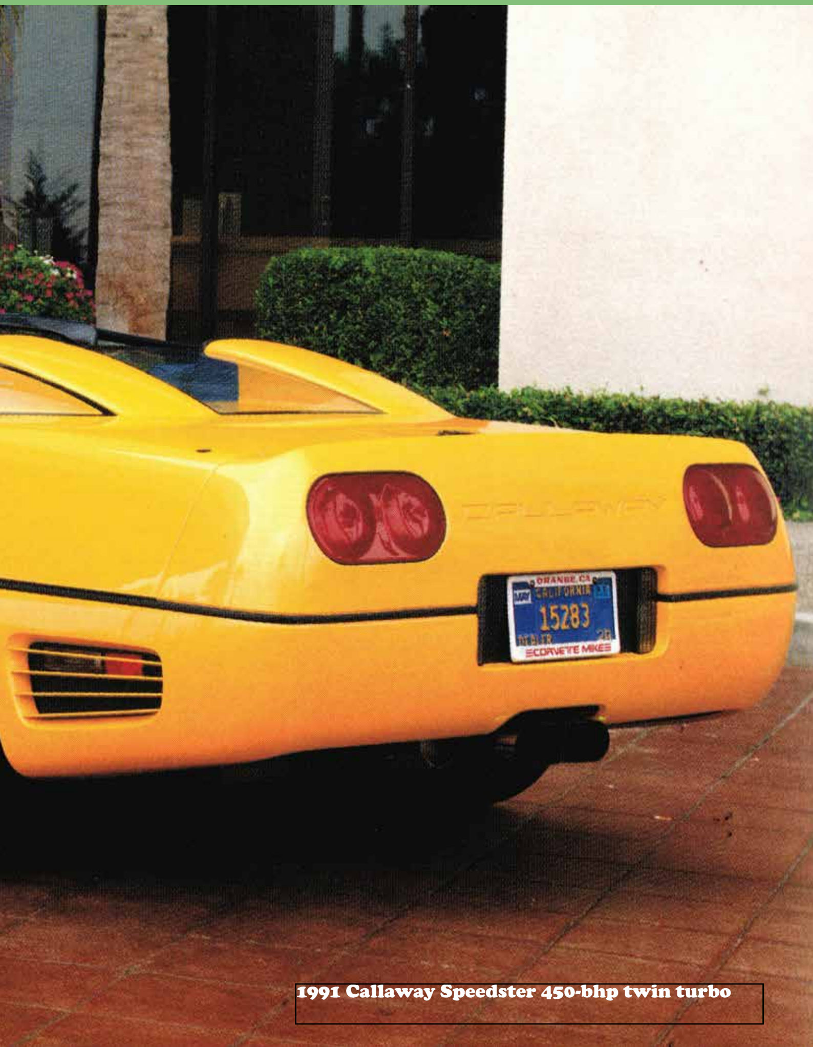
1991 Callaway Speedster 450-bhp twin turbo